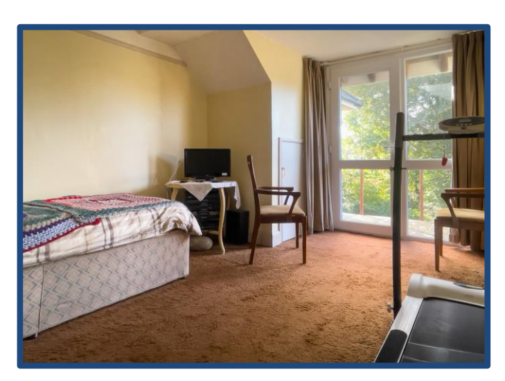
More photographs may be available on our website www.maysagents.co.uk

The mention of any appliance and/or services in these sales particulars does not imply that they are in full and efficient working order or that they have been tested.